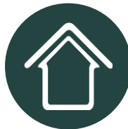
Eco Building & Recycling