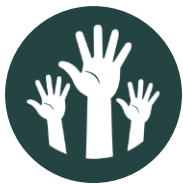
Green Kidz Environmental Education

The work is very hand-on, so expect to be busy but remember to have fun!