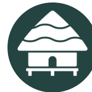
Eco Village Management